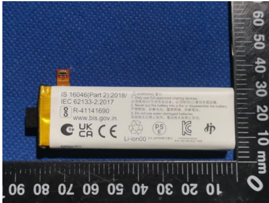
电池组外观 1 View of the battery 1