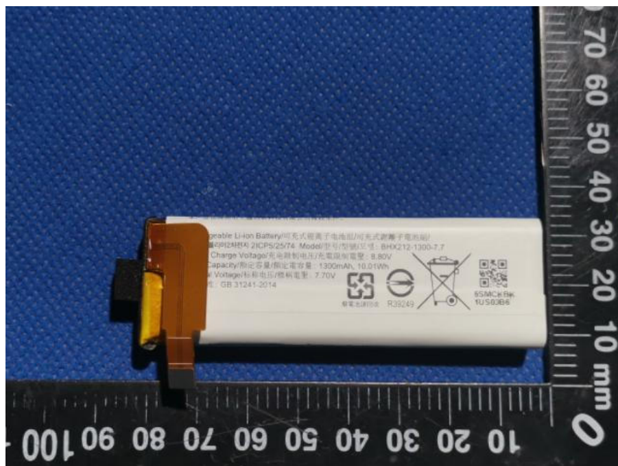
电池组外观 2 View of the battery