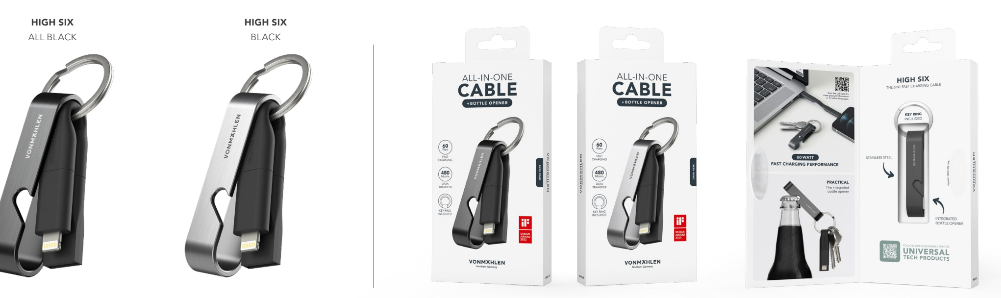
SKU HSI00001 RRP MOQ 27 pcs