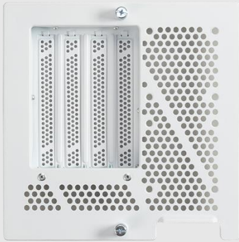
Vertical PCIe Bracket