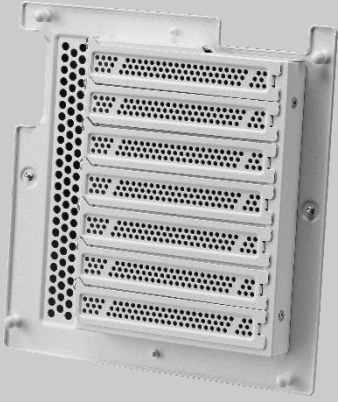
Horizontal PCIe Bracket(pre-install)